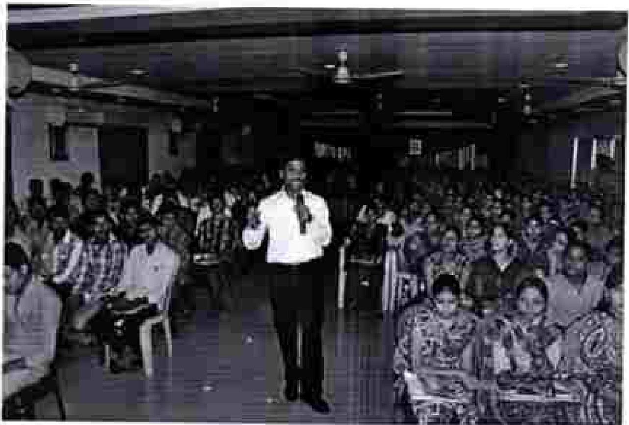
STUDENTS ATTEND SEMINAR ON GUIDANCE FOR COMPETITIVE EXAMINATIONS